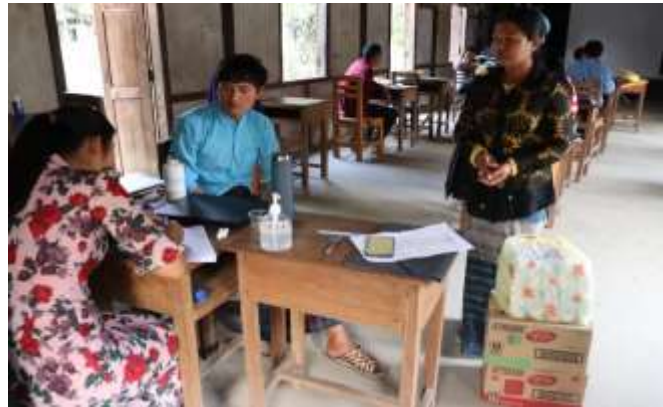
Figure 2 Delivery of financial supports for referral cases to Parish volunteers

We provided food support to one family in 15 miles who are in Home Quarantine. Although there are no cases reported yet in the areas and requested referral support, we delivered some cash advance to the Parish ERT and KMSS response teams for referral transportation, food support and other necessities for cases. We supported financially and logistically to St. Joseph Quarantine center renovation.