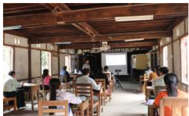
Figure 5 Training of Emergency Response team