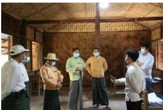
Figure 4 Joint visit of Diocese and Government to Preparation of St. Joseph Quarantine Center

We, KMSS-Banmaw, are in regular coordination with government officials, stakeholders, National KMSS office, donors and JST team for collective response actions. We conducted one coordination meeting with Diocesan health committees and formed Banmaw Diocesan ERT in March. Provided technical TOT training of COVID-19 to Diocesan ERT from 2 nd April to 4 th April 2020.