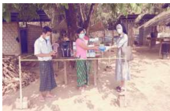
Figure 1 Distribution of Masks in the Parish areas