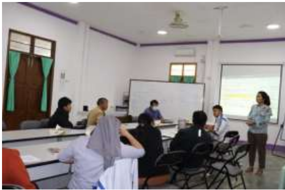
Figure 3 Coordination meeting with KMSS and Diocesan committees