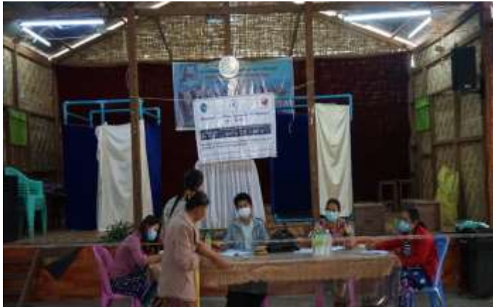
Figure 6 Distribution of Cash for Food of WFP Project